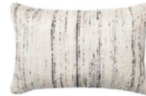
13" x 21" lumbar